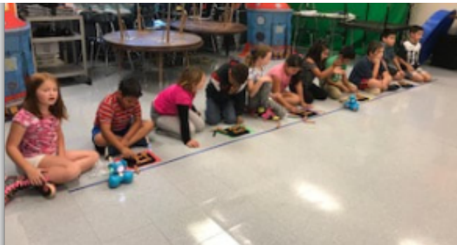
Half of the team was on one side of the room attaching the materials, while the other half were at the build site. No crossing the tape lines!

It's important to instill empathy in our students when natural disasters occur. Whether it's a hurricane, flood, tornado, wildfire or some other catastrophic event, we can bring relevance to even our youngest learners by showing how we help each other rebuild. "Dashing to Rebuild" is a lesson designed to show that teamwork is needed in any rebuilding effort.