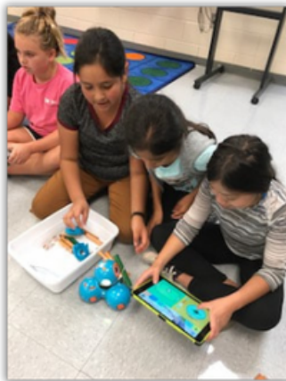
Engineers had to get the building materials (Lincoln Logs) to the build site with limited attachment options.